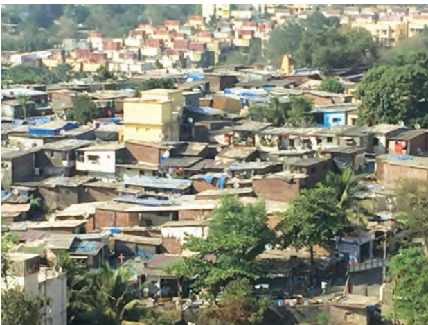
Figure 10.2 : Emergence of slums

Slums : Because of urbanisation, the population in cities increases rapidly. But the housing facilities do not increase in the same proportion as the population. Most of the migrated people are economically weak. They cannot afford the housing offered in the cities. Migrated people have generally come