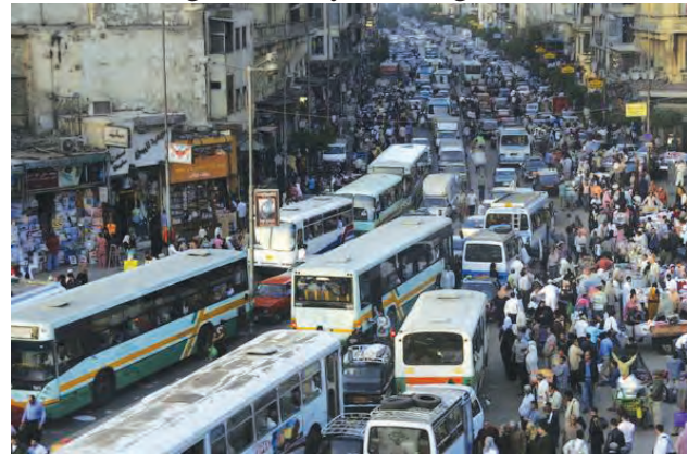
Figure 10.3 : Traffic jams

Traffic jams : As cities grow, people start living in the outskirts and suburbs of the city. People commute from the suburbs to the centre of the city for businesses and industries, trade, jobs, education, etc. Public transportation system is not sufficient and hence the number of private vehicles increases. This leads to an increase in traffic jams and travelling time increases significantly. See fig 10.3.