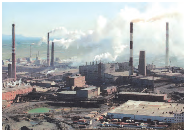
Figure 10.1 : Industrialisation

The development and concentration of industries in a region is a factor contributing towards urbanisation. Increase in industries leads to increase in the hopes of people who are attracted towards these industries from surrounding areas. This increases the speed of urbanisation. In the 19th century, Mumbai grew rapidly because textile mills started on a large scale in Mumbai. Many villages, which were originally fishing villages ( koliwad ), became part of Mumbai metropolitan area because of industrialisation and urbanisation.